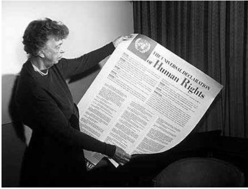
Eleanor Roosevelt holds the text of the Universal Declaration of Human Rights - the result of works led by it to the UN Commission on Human Rights (Interestingly, the Commission's first deputy head was a Ukrainian international jurist Volodymyr M. Koretsky)

The distinguishing feature of inspiring people is their courage and determination in defending what they believe is important to realize freedom and guarantee many other people their rights.