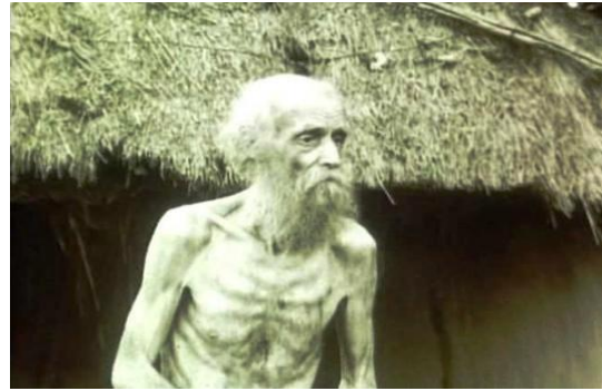
Still from Hunger 33 (1991) about Ukraine's Holodomor

documentaries (e.g., a film by J. Moll The Last Days (1998), C. Lanzmann's Shoah (1985)). Several films devoted to the tragedy in Babi Yar, the mass execution of civilians, particularly Jews and Gypsies, in Nazi-occupied Kyiv in 1941-1943.