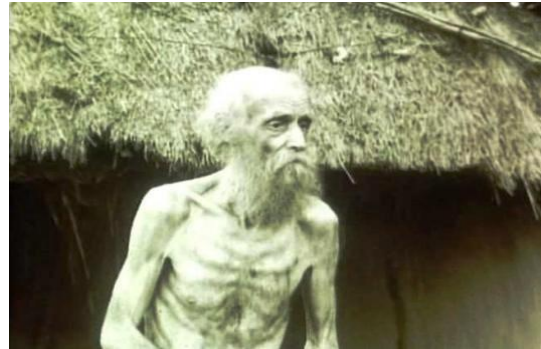
Still from Hunger 33 (1991) about Ukraine's Holodomor