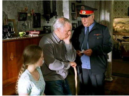
Still from The Rifleman of the Voroshilov Regiment (1999). The granddaughter asks: «Grandpa, what they're looking for?», he replies: «Conscience. Conscience is that what they lost».

Right of the Father (1999), The Rifleman of the Voroshilov Regiment (1999), Law Abiding Citizen (2009). Generally, the phenomenon of private justice is presented ambiguously. On the one hand, it is justified as an inevitable and ethically just ostensible way to implement the accountability principle, on the other it is condemned as a wild, imperfect, unjust and illegal (as in Fury (1936), A Time to Kill (1996)).