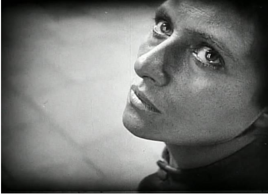
The Passion of Joan of Arc (1928) is also about the right to life

Cinema, and film as its product, is both a more developed and more accessible (in many ways) tool for reflecting the reality and its artificial (artistic) creation.