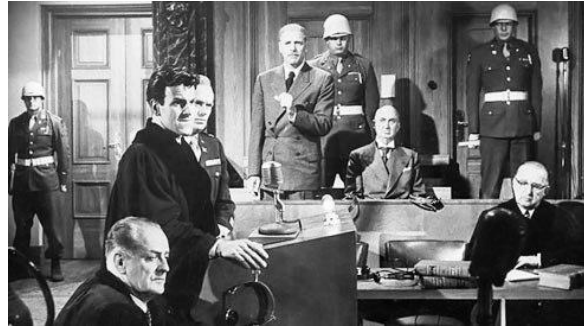
Still from Judgement at Nuremberg (1961)

emphasized in German philosophy of law and post-Soviet legal philosophy, between law as a state statutory binding norms (in German Gesetz ) and law non only statutory norm but also rights ( Recht ) is instrumental.