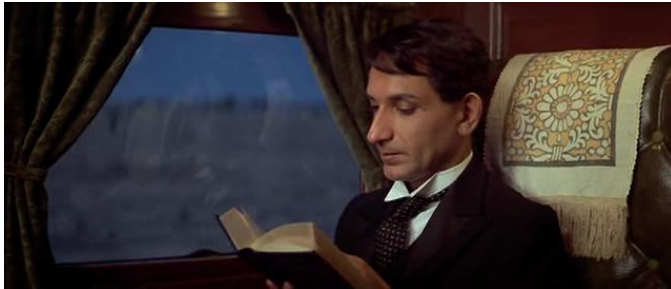
Still from Gandhi (1982). Young lawyer Gandhi is about to face discrimination, something he will fight against

wanted to become lawyers (as Malcolm X) but could not make it due to social and other circumstances. In general, the advocacy of lawyers is in the HR sphere has not received widely