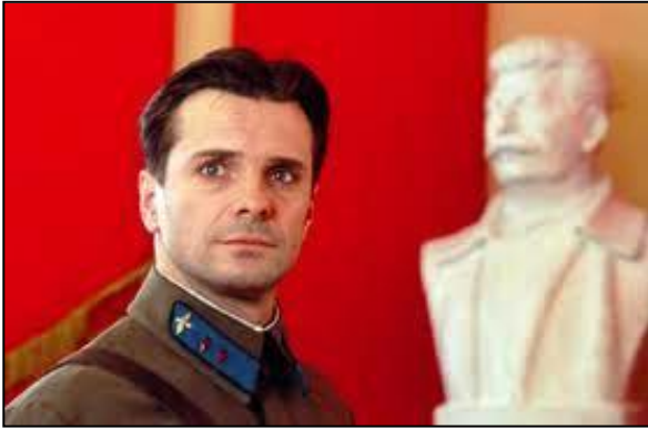
Sergei Astakhov as Sergei Korolyov in the «Korolyov» film by Yuri Kara

This HR issue is depicted as a form of reflection of injustice. Here are a few examples.