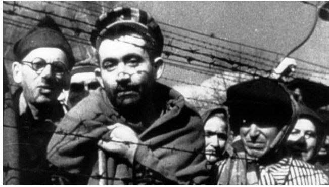
Still from Night and Fog (1955)

thematically diverse collections reflect contemporary HR issues as presented by film directors.