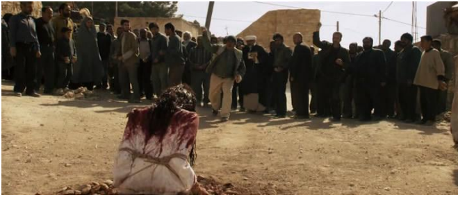
Still from The Stoning of Soraya M. (2008)