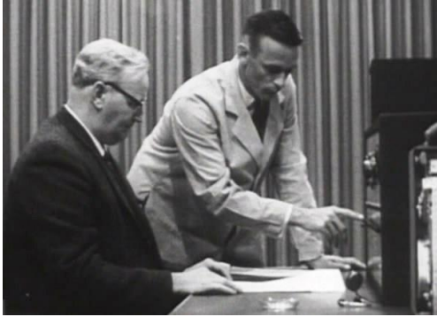
Still from A Mailgram Experiment (2009)

Justice and HR. Justice is a value (ideal) and a state created as a result of HR compliance.