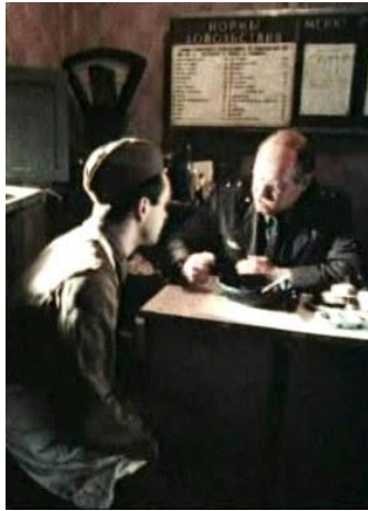
Still from Oxygen starvation (1991) (The Soldier/Commander dialogue: «... please do not offend me as human» / [while beating his fist at the table]: «Human? Shit you're here, and not a human».

(2003), army hazing in Oxygen Starvation (1991, a screenplay by Y. Andruhovych), extra-judicial killings, secret assassinations, murder salaried individuals in The Team Killers (1996), torture within the «territory outside the law» in The Road to Guantanamo (2006), Torture: The Guantanamo Guidebook (2005)).