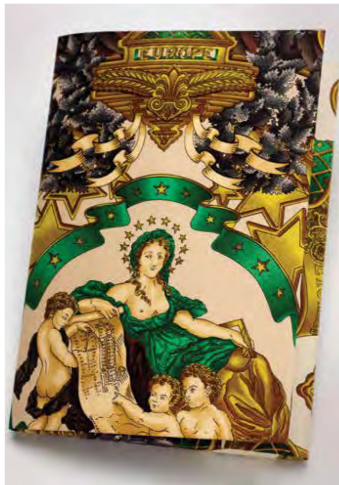
Above: The document sleeve for the inauguration of the Human Rights Building in 1995 was prepared by Hermès and depicts Justitia, the Roman goddess of justice.